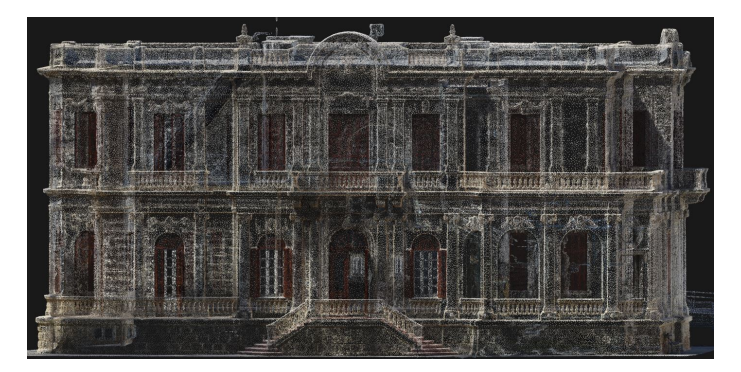
Fig. 2. Sparse Point Cloud of the Pilavakis Mansion

The Library of the Limassol Municipality was initially housed in the main hall of the Municipal Mansion and was opened for the people in October 1945. Later in the early 1970s, the library moved to the Pilavakis Mansion<sup>2</sup>, because of the limited space in the municipal hall and the needs for a modernized library that will satisfy the needs of the citizens. The construction of the Pilavakis Mansion, which currently is a trademark for the city of Limassol and a point of reference for its citizens, began in 1919 and was passed to the ownership of the municipality in 1966. The style and decoration of this