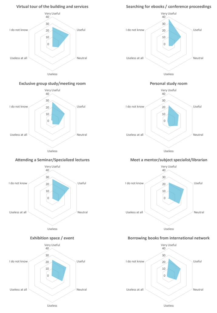
Fig. 1. What services would be useful in a VR library?

In this survey, we also aimed at understanding the technological background of the participants, and sketch the profile of a potential user of the VR library. The ultimate target is to assess the potential utility / popularity of visiting and using a virtual library. The 22% of the participants claim to be regular users or experts with VR technology, 45% have used VR only once, and 33% have never used VR. However, none of the participants actually own a VR headset, 85% do not have direct access to a VR headset, while only 15% have access to it (mainly those coming from the Physical Sciences & Engineering field). This proves that using this technology