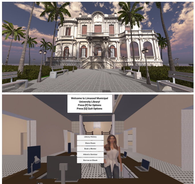
Fig. 4. Top is the initial VR scene; bottom shows the front desk assistance.

The scope of our library's design is to captivate the interest of the visitors by creating a convenient, accessible, and interactive environment. In the design, it is essential to take into consideration that users must have a large degree of autonomy and agency in the exhibition and use of the digital library. In that manner, we have developed a virtual librarian agent who greets the users when entering the building, offering assistance and the available options in a selectable menu; Figure 4 bottom shows the front-desk where the virtual agent welcomes the user, after the main entrance of the building.