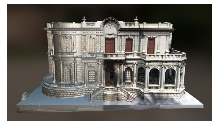
Fig. 3. Untextured and textured of the 3D model, as illustrated in SketchFab.

Following the process of creating the sparse point clouds, the last step is the creation of a detail mesh of the asset, and the corresponding texture map. It is highly advised to clean up and reduce the size of the mesh resolution before creating the UV and texture map to avoid high computational cost in time and huge data files. This is more apparent when creating assets for VR where the content needs to be as efficient as possible to achieve high performance [11].